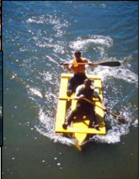
Can you identify these men?