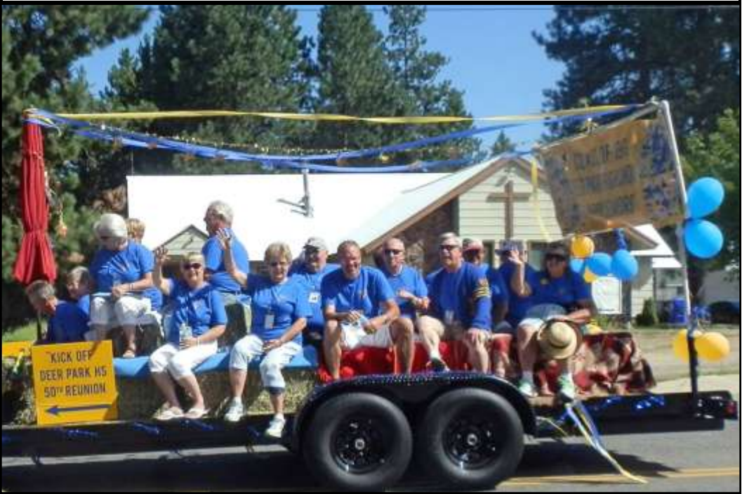
The DPHS Class of 1963 photographed in the 2013 Settlers Day parade. This is the 50th class to graduate from Deer Park High School.

In honor of Deer Park High School's 100 th graduating class, an All-Class Reunion was held in conjunction with Settlers Day on July 27, 2013. There was a lot of participation! About 137 DPHS Graduates, from many different classes, signed in and