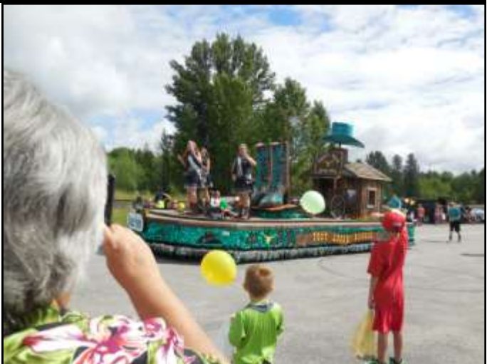
Right: Trees in background seem part of the Deer Park float during the Clayton Day Parade.