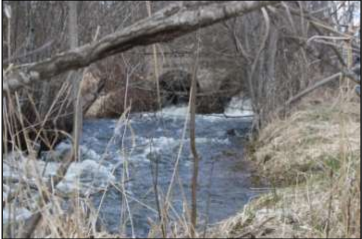
Figure 4: Downstream view of the weir/dam with the large cast holes for the pipes to carry water to the generators. The weir has been broken and water is flowing through both the holes and the eastern side of the retaining walls. )

Without knowing the precise location of the fifteen foot high dam described in the newspaper articles the actual operation of the generating facility can only be estimated. Interpreting the facility as it stands today it would appear that there was minimal water volume impounded by a dam.