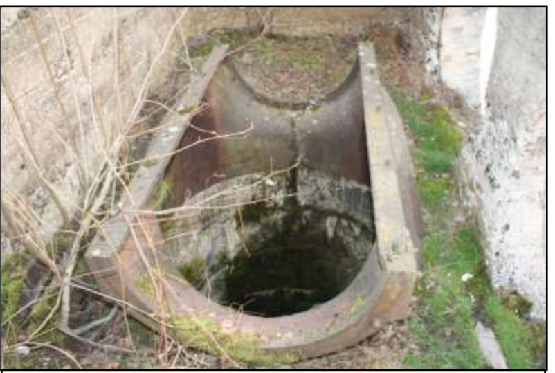
Figure 6: Rusting iron frame inside the "generator house" that may be a turbine base. To the right are the large circular holes that conducted water into the structure.

By August of 1928 the Mount Spokane Power Company was sold to W. B. Foshay Company of Minneapolis<sup>18</sup>. It was reported that Foshay and his company paid $125,000 and stock for Mount Spokane the Power Company<sup>19</sup>. The purchase included three Mount Spokane Power Company generating sites including the Little Spokane River generating site. Part of Mr. Foshay's