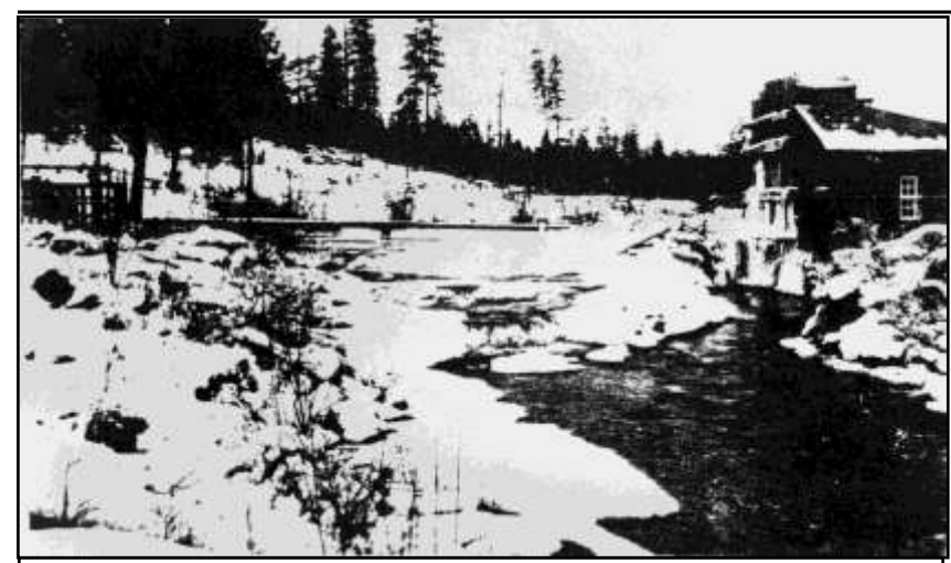
Figure 2: View of the Little Spokane Power plant and what appears to be a dam in the left center of the picture. Today nothing remains of this structure