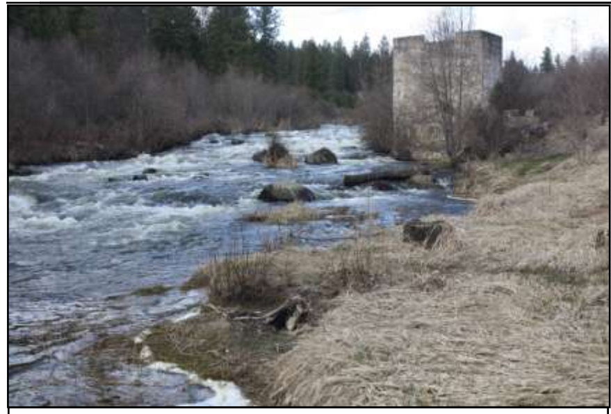
Figure 3: The concrete tower remaining next to the Little Spokane River. Early pictures show water spilling over the notch in the top of the tower. ( March 2013 Coffin picture )