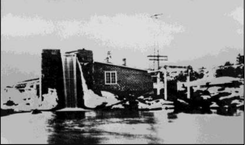
Figure 8: Undated photograph of the Little Spokane River power plant in operation. Water is flowing over the top of the concrete structure. To the left the pipes bringing water into the structure can barely be seen. In the right center of the picture are poles holding the transmission wires. To the far right is the Great Northern railroad embankment.

The Public Utilities Corporation Consolidated continued operation to 1935 when the reconstituted company was incorporated in Delaware as the Citizens Utilities Company. Consolidation of companies power continued through the 1940s and 1950s along with increasing controversy over