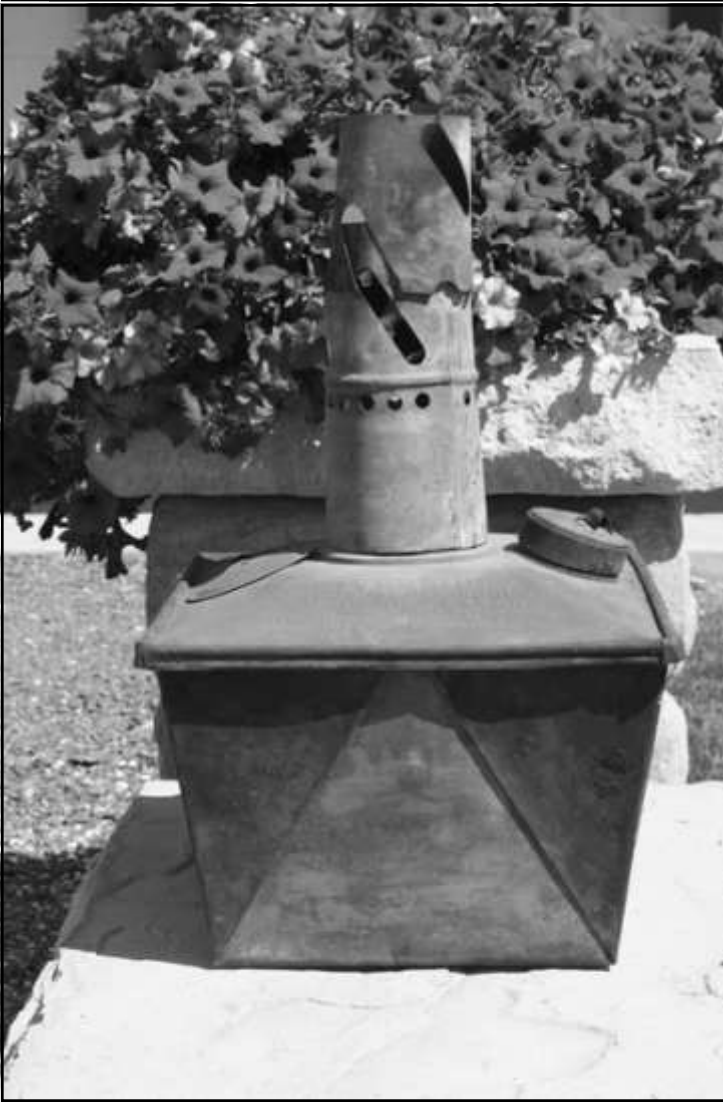
Figure 1: The Arcadia Orchard Company smudge pot in the Clayton-Deer Park historical Society's collection. It is perhaps one of the 25,000 delivered in 1920. Petunia flowers in the background give an idea of the size of the smudge pot.

expected in a week or so. 3 The oil for the smudging operation was to be purchased from the Standard Oil Company and be delivered by truck and horse team to several concrete storage tanks throughout the orchards. The pots themselves were to be distributed to both contract holders and the tracts cared for by the Arcadia Orchard Company.