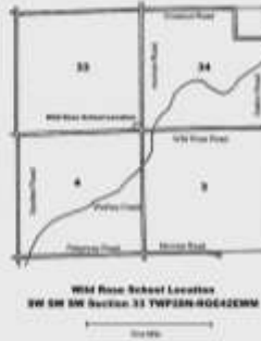
Figure 14: The Wild Rose School was located at the intersection of Wild Rose and Monroe Roads. The building in the photograph was replaced by a much more substantial building that is still standing today and being used as a community meeting center. In some respects, the Wild Rose area was the center of settlement that migrated to Deer Park after the Short and Crawford Standard Lumber saw mill was constructed. My Great-Grandfather, Pleasant Madden was on the school board in the very early 1900s. ( Lawrence Zimmerer Photograph Collection, P. Coffin Map )