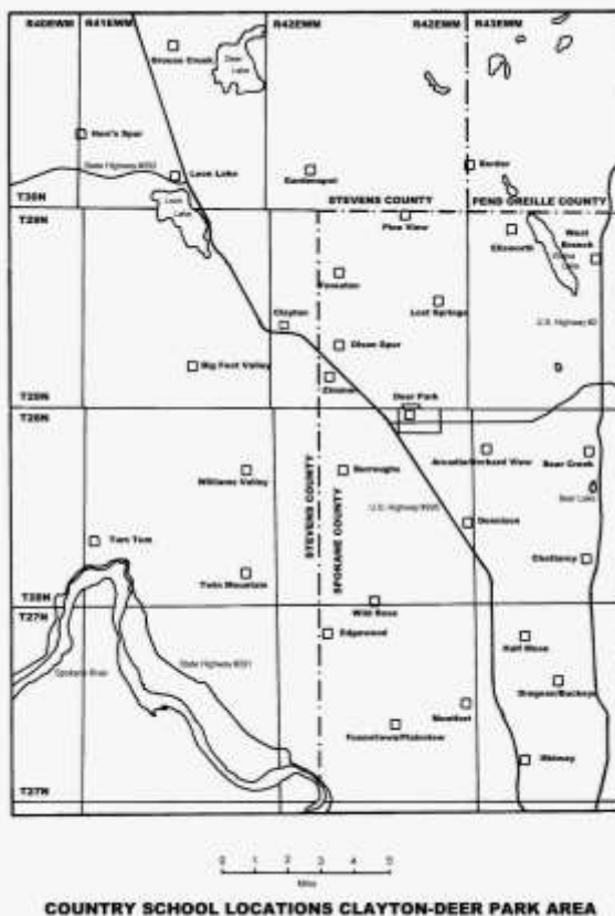
Left: Figure 1: Map showing the locations of the many rural schools in the greater Clayton/Deer Park area.

All Rights To This Material Reserved By C/DPHS