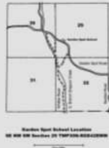
Figure 9: The Garden Spot School was located about halfway between the present Garden Spot Grange building and Loon Lake, WA. The area was the site of a stage stop on the old Cottonwood Road before 1900. ( Photograph courtesy of Linda Bode, P. Coffin map )