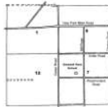
Arcadia (Orchard View) School Location C28 NW Section 7 T19P24N R02E12W

Figure 2: The Arcadia (Orchard View) school was located just east of Deer Park and south of the Deer Park Milan Road in the Arcadia Orchards. Society member Kenneth Westby's mother, Thelma Norseth, is in this photograph. (P. Coffin map.)