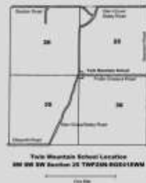
Figure 13: The Twin Mountain School was located in the far southwest portion of the Deer Park area just north of the Spokane River valley. ( Lawrence Zimmerer Photograph Collection, P. Coffin map )