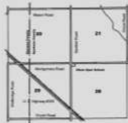
Olson Spur School Location NW 1/4 NW 1/4 Section 20 T40N20W-R10E20N