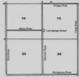
Lost Springs School Location NE 1/4 NE 1/4 SW Section 12 T40N20W-R10E20N