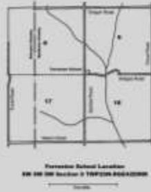
Figure 8: The Forreston School was located northwest of Deer Park and east of Clayton. This log building was replaced with a lumber structure which was moved north from the original location and became a private residence at the intersection of Bridges and Spotted Roads. ( Lawrence Zimmerer Photograph Collection, P. Coffin Map )