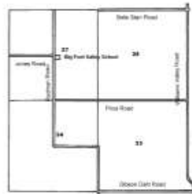
Big Foot Valley School Location NW NW NW SE Section 28 T19P24N R02E12W

Figure 3: The Big Foot Valley School was located at the intersection of Jones and Redman Roads in Big Foot Valley. No full picture of the school is available. This is a picture of a church group in front of the old school house. My Father, Elden F. ("Jack") Coffin, is the small boy on the far right of the picture. (P. Coffin map)