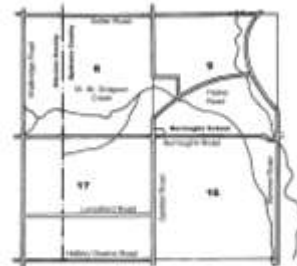
Burroughs School Location SW SW NW Section 18 TWP20N-R0E43EWM