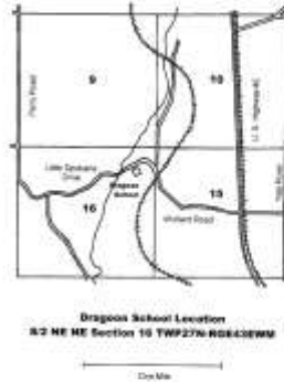
Figure 6: The Dragoon School apparently had two names, including Buckeye for the saw mill community near which it was built. (Lawrence Zimmerer Photograph Collection, P. Coffin map)