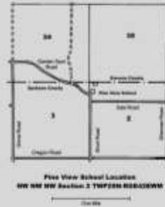
Figure 12: The Pineview School was located just south of the present day Garden Spot Grange building. Its roof is just visible on the lower left side of the photograph. ( P. Coffin map )