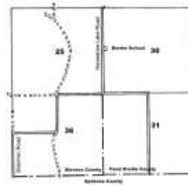
Borders School Location SW SW NW Section 30 TWP30N-R0E43EWM