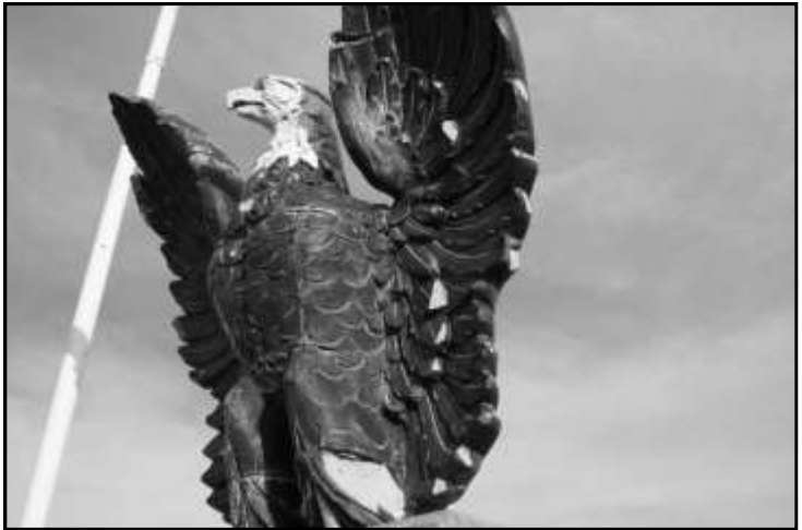
Figure 3: Spokane Armory Eagle Figure, view to the northeast

of fresh terra cotta. Subsequent to removal from its original location, it was painted its current dark brown, white, and yellow colors.