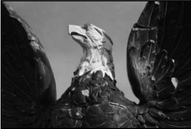
Figure 4: Spokane Armory Eagle Figure, head detail, view to the east.

tails were placed along the cornice as well, embellishing the striking fortress-like appearance of the battlements. Behind the eagle, an American flag flew from a pole. By the mid-1970s the Armory building lay vacant. Plans were made to tear down the seemingly obsolescent structure. In 1979, however, the building was saved when the Spokane City Council, objecting to a Park Department plan to remove the building to create green space, voted to buy it. Instead of destruction, it was leased to the