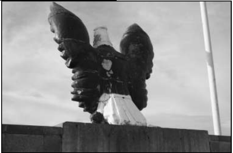
Figure 5: Spokane Armory Eagle Figure, rear, view to the northwest.

In 1923, the Washington State Armory building was built. At that time the terra cotta eagle was placed at the center of the front cornice, perched atop a panel that had the words "State Armory" incised into it. Other terra cotta de-