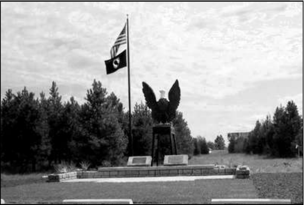
The National Guard Eagle home in Clayton in August 2010.