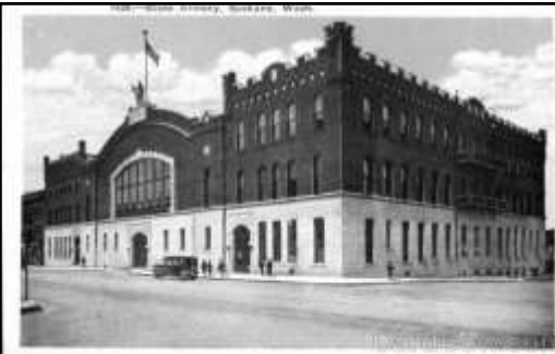
State Armory, Spokane, Washington

It dawned on me that I hadn't noticed it sitting up there in years, so after lunch we decided to venture down and snap some photos because I figured it