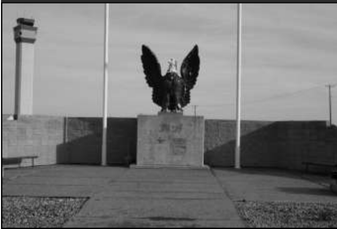
Figure 2: Spokane Armory Eagle Figure, view to the east.