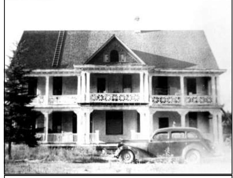
Figure 6: The Boarding House sometime in the 1945. This is the front of the house.

the house was built. The front porch was two stories high and ran across the full length of the house. I was surprised recently to see a picture of the house in the early 1900s and see that the second floor front porch was not there when the house was originally built but was added later. I don't know when it was My father had added. removed the second story porch by the 1950s for safety reasons. I do remember jumping off the upstairs porch to impress my sister's older friends and hurting my back. He also removed the beautiful, but rotting, porch post and railings.