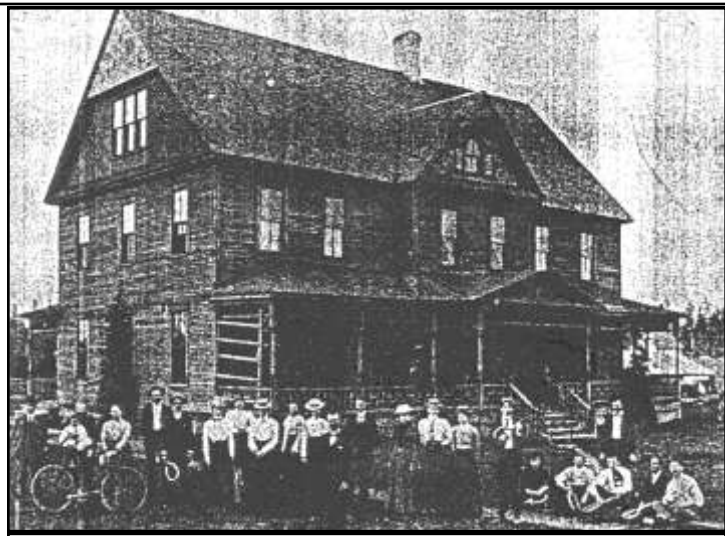
Figure 5: A picture of the front of the house in the early 1900s. Note that there is not second story porch. (Digitized from the Short manuscript, 1971, p. 18)

It was a wonderful house for children with all the porches, rooms, attic and out buildings. There were four porches, including a full back porch and a side porch that was enclosed for food storage, as was common when