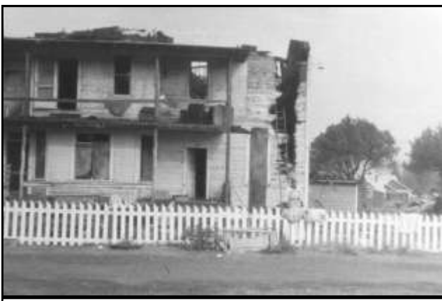
Figure 8: The Boarding House after the 1964 fire.

Short, W. H., 1971, From whence we came: Manuscript from the Deer Park Congregational Church, 66 p.