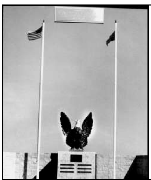
The Eagle Memorial at Geiger Field1982