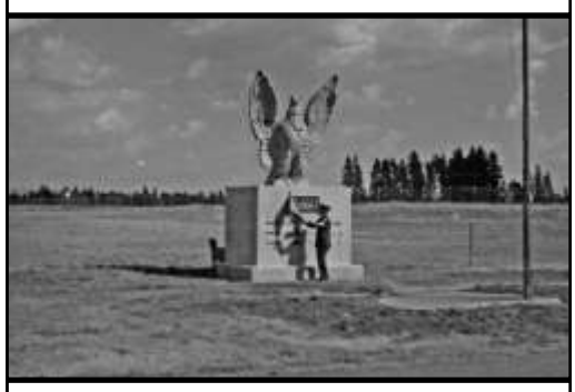
Unveiling of the Plaque—CMS Wm. Mitchell

But I cannot help but reflect that the history of the Eagle is similar to the 161st itself. Just as the Eagle was composed of separate pieces, then