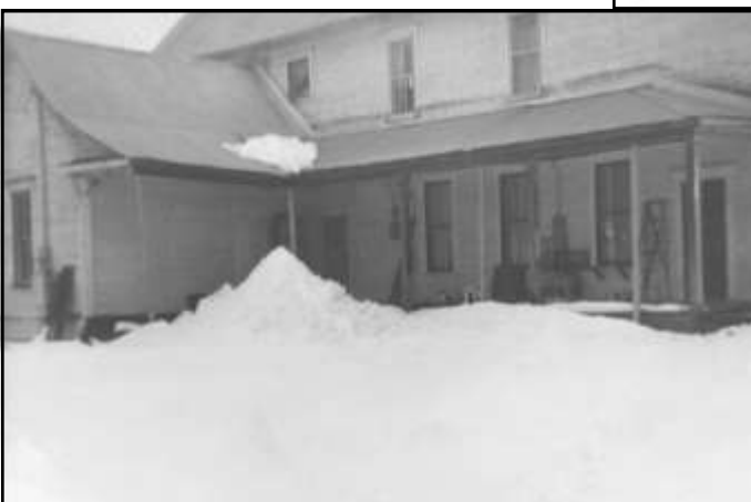
Figure 3: This photo shows the same north facing back of the house as it appeared in the 1950s and 1960s. the rails on the porch had been removed. ( Haden photograph )