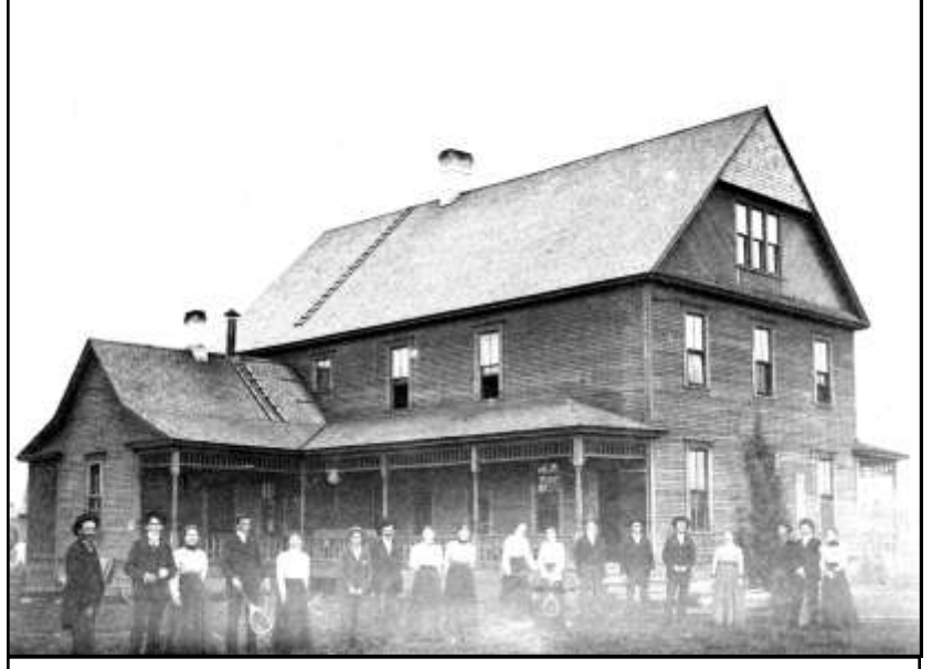
Figure 2: The Short Boarding house from the northwest. No date is given on the picture nor are any of the people identified but the women's clothing suggests it may have been taken near 1900. The tennis court net is seen in the far right portion of the photograph. This shows that the second story front porch had not been added. (Continued on page 363)

The maintenance of the Boarding house was the responsibility of "Bama" Short and in addition she set the "...tone and behavior..." for those staying in it (Short, 1971, p. 19). In about 1904 the rooming and boarding of employees was phased out (Short, 1971, p. 35). Even though there was a hotel in Deer Park in 1904, the Boarding House served as a company guest house and as a rooming house for "...two or three of the old timers..." who wished to stay at the Boarding House for a few weeks. Two of the west end rooms were used for offices of the Standard Lumber Company, but the rest of the house became the Short family residence.