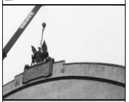
Getting tethers in place —First time attempt was made to take eagle down, Fall, 1982