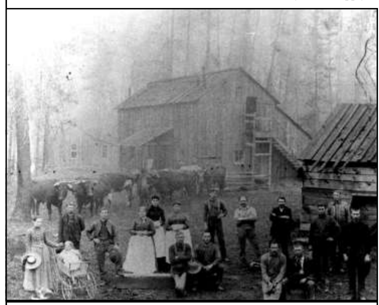
Figure 1: The first Short Boarding House in the background. Many employees of the mill and the Short family are pictured.

William Hodges Short's (William Hopkins Short's son) manuscript describing the founding of the Deer Park Open Door Congregational Church contains the following (Continued on page 362)