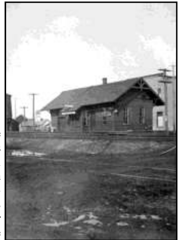
Figure 6: The Spokane Falls and Northern Railroad station in Deer Park in approximately 1908. In the distance just below the left hand eaves of the station is the bell tower of the Congregational Church and directly behind the station is the Kelly Mercantile store.

The Spokane Falls and Northern Railroad ran quite a few passenger trains through Deer Park during these years. It was possible to go to Spokane in the morning, shop for the day and come home in the afternoon apparently quite easily. However, going to Spokane for entertainment was fairly rare.