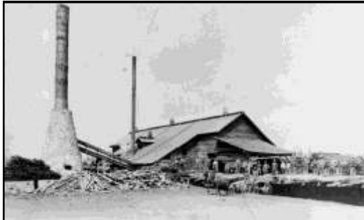
Figure 4: The Standard Company saw mill in the 1900 to 1911 time period. The mill was located just west of the railroad tracks and about 100 yards north of Crawford Street in Deer Park.

It should be noted that all hauling was done with horse and wagon or sled. The price is assumed to be for 1000 scaled board feet of logs and Standard Lumber was the Short and Crawford mill