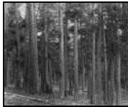
Figure 7: Picture of a virgin stand of Ponderosa Pine forest somewhere near Deer Park. It is likely that this was the sort of timber being cut and shipped to the Standard Lumber Mill from the Williams Valley area.

A sled load of 2589 board feet of logs must have been quite a sight. On the 29th of January, he hauled a load of 2929 board feet and on the 13th of February, he hauled a load of 3722 board feet. People visiting the Masons and staying for dinner was very common. The women doing the cooking must have been very skillful to feed everyone that apparently just dropped in for the meal.