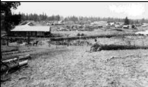
Figure 8: A picture of the L. C. Gemmill Mill on Dragoon Creek taken about the same time as this diary was written. The flume brought creek water to power the water wheel in the mill. Quite a settlement is seen in the background as well as many piles of drying lumber.

The first mention of Arcadia (and the Arcadia Orchards Company) in this diary. Arcadia Orchards Company was incorporated in 1906.