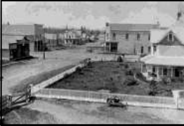
Figure 9: A 1908 picture of downtown Deer Park looking west on Crawford Street across Main Avenue. The Kelly house is on the far right and partially blocks a complete view of the Kelly store. The second floor of the Kelly store building was a large meeting room used by the Knights of Pythias Lodge.

hay with a scythe and cradle. This is very hard work and a very slow way to cut hay!