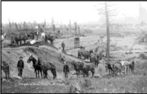
Figure 10: The Arcadia Orchard Company's Dragoon Creek dam under construction. At the time, it must have been quite a construction operation as evidenced by the number of horse teams and the steam engine in this picture.

Tuesday, April 28, 1908: "Clear and windy all day. I pulled pieces of stumps out of the garden this forenoon. This afternoon I finished hauling the