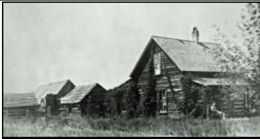
Figure 3: The original Mason farm house and barn with Estella Mason sitting in front of the porch.

Tuesday, January 2, 1906: "Cloudy and chilly all day 20 degrees above zero this morning. I hauled two loads of logs from Mixes place to Deerpark today. I bought some tamarack and four logs of mix. The Standard Lumber Company is giving $3.50 for