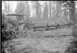
Figure 5: "Old Buck," the steam driven traction engine in the woods with a string of loaded cars. The location of this picture is not

known but must certainly represent what it looked like near the Mason farm as logs were carried from the area to the Standard Mill.