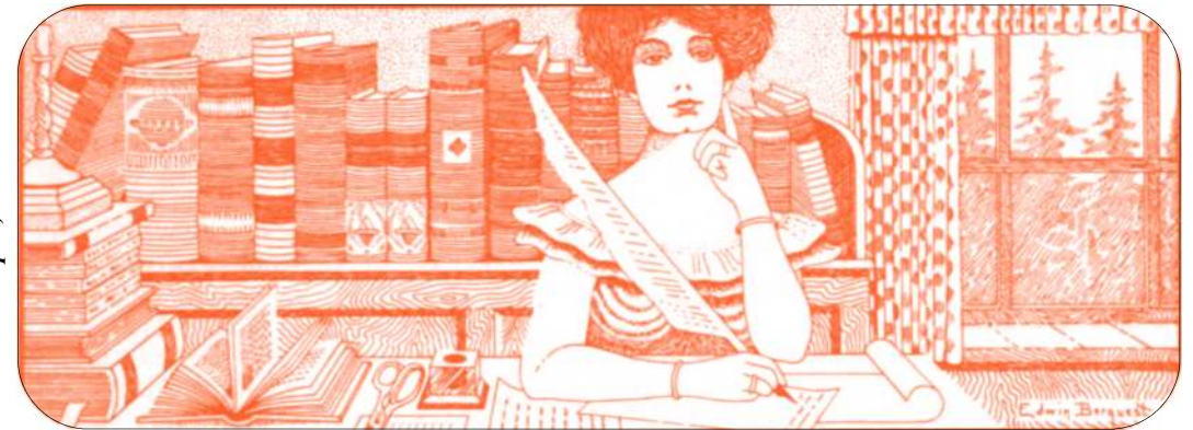
From “The Coast” magazine, April, 1907

When requests to reprint C/DPHS materials are received, such will be granted in almost all instances — assuming of course that we have the right to extend such permission. In instances where we don't have that right, we will attempt to place the requester in contact with the owner of the intellectual property in question. But, as a matter of both prudence and common courtesy, in all instances a request to reprint must be made, and must be made in writing (letter or email), before any C/DPHS materials are reprinted.