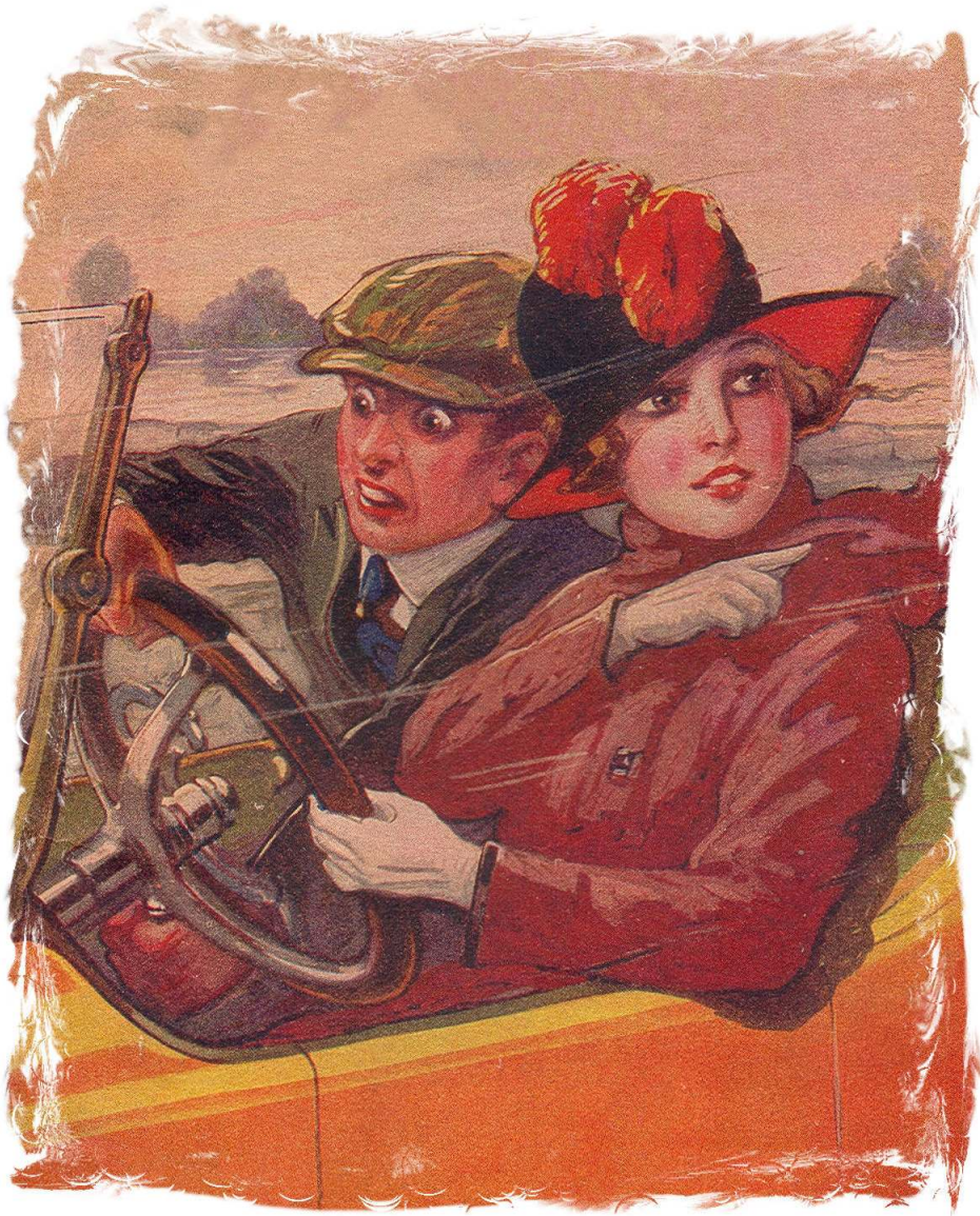
Illustration from the Automotive Digest, March, 1920.

Keep summer's excitement going all year around!