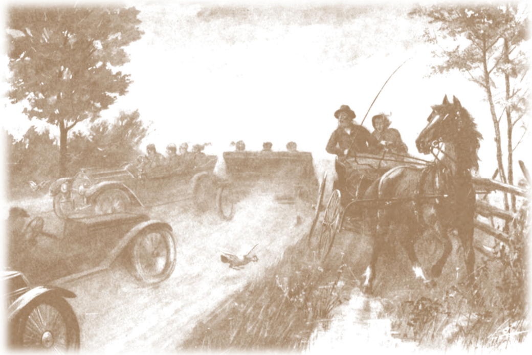
Illustration from Life Magazine, October 5, 1911.