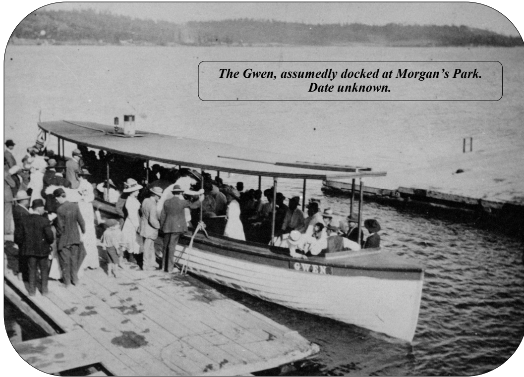
The Gwen, assumedly docked at Morgan's Park. Date unknown.