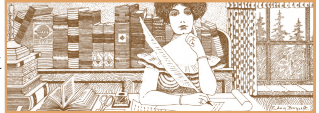
From “The Coast” magazine, April, 1907