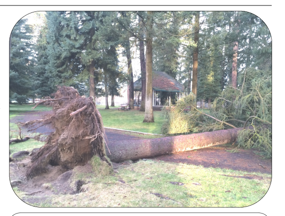
Society member Mike Reiter took this photo of one of the "several" trees toppled in Deer Park's city park (the tourist park) by the November 17<sup>th</sup>, 2015, windstorm.

"The heavy windstorm that struck this section recently blew over a large number of trees in the tourist park and otherwise created damage. The work of cleaning out this damage may be good CWA (Civil Works Administration) work in case the local heads run