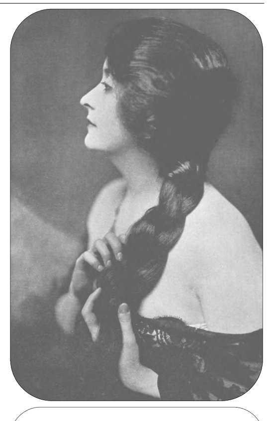
Clara Kimball Young September 6, 1890 — October 15, 1960

Full-size ads — such as the one reproduced on the facing page — appeared in almost every issue of the paper thereafter, but these ended on November 22<sup>nd</sup>, 1918, thanks to a world-wide post-war disaster. The Spanish Influenza epidemic had reached the Deer Park area, affecting about 200 individuals, and the city fathers declared a general quarantine