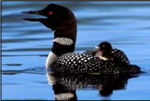
Loon with chick

the tailgate of our pickups. The gift shop has done its job so well, almost everyone in the area and maybe even the state, now knows what a loon is, what it looks like, how they act and what they need. And they know that in Loon Lake you do not call a loon a duck!!!