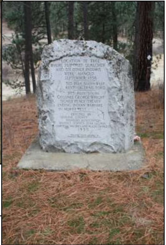
Figure 9: The monument marking the hanging of the Indians on the banks of "Hangman Creek" or Latah Creek. The hanging spot is indicated to be about 1000 feet southwest of the monument on the banks of the creek where the troops camped.

On the evening of September 24, 1858, fifteen members of the Palouse tribe were seized near the Palouse River and six were promptly hung giving the stream upon which the command was camped "Hangman Creek" (now Latah Creek). A few days later Owhi was shot and killed as he attempted to