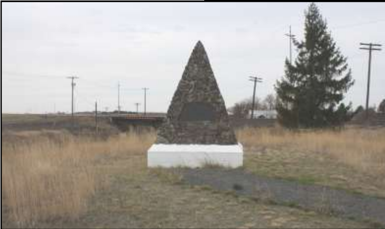
Figure 6: The Battle of Spokane Plains monument just west of the Fairchild Air Force Base entry gate on United States Highway Number 2.

Indians from behind trees and rocks, and from ravines on the prairie until most of the Indians were forced onto the "Spokane Plain" near present day Fairchild Air force Base.