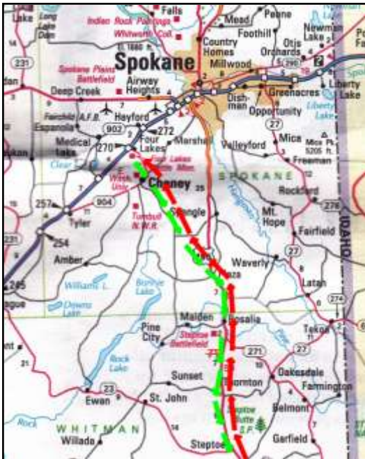
Figure 1: Red (darker) line is the route Lieutenant Colonel Steptoe took north to near the town of Four Lakes. His retreat route is shown in the green line. The Steptoe Battlefield is marked on the south side of Rosalia. (Rand McNally Washington State Map of 1995)

On May 6, 1858 Lieutenant Colonel Steptoe left Walla Walla to go north and investigate Indian harassment of settlers and trouble at Colville. He had a force of 158 men with two mounted howitzers. These soldiers were inadequately armed with old muskatoons that could only shoot accurately as far as a man could throw a rock, revolvers, and only about 40 rounds of ammunition per man.