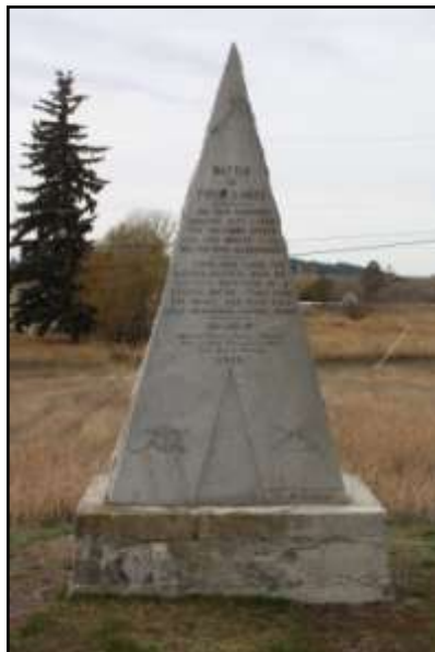
Figure 5: The Battle of Four Lakes monument in the town of Four Lakes west of the old Spokane-Pullman highway. The Indians were chased from the hills in the background.

were alive with the Indians, they had marched to subdue. The soldiers were armed with rifles that had considerable more range than the muskets with which Steptoe's men had been armed and advanced towards the Indians. The range of the rifles took its toll on the Indians who retreated to the north carrying their considerable number of dead and