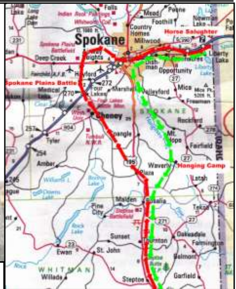
Figure 4: Map showing the routes taken by Colonel George Wright. The red line follows approximately Colonel Steptoe's route to near Four Lakes. From there the route crosses the Spokane Plains to the north and then eastward along the Spokane River.