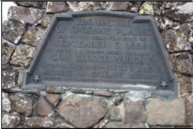
Figure 7: Inscription on the Battle of Spokane Plains monument.

After resting for three days, Wright again set his command moving northward toward the Spokane River where scouts had seen the Indians gathering. The Indians had set the prairie grass on fire in an attempt to slow the soldiers' advance and then attacked. The soldiers began driving the