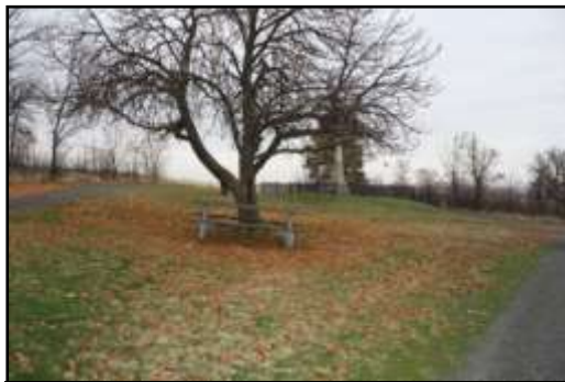
Figure 2: Steptoe Battle Field monument on the southeast side of the town of Rosalia. (P. Coffin photograph 2012)

After a desperate running fight in retreat Steptoe