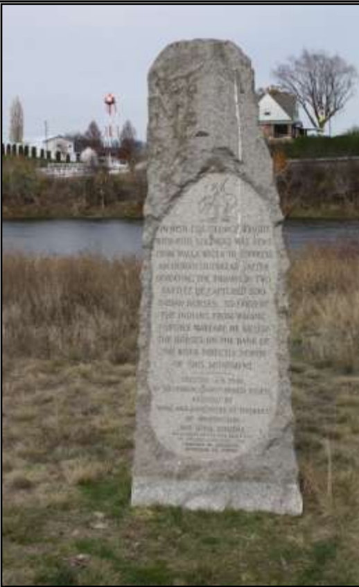
Figure 8: The horse massacre monument on the south bank of the Spokane River west of the Washington-Idaho state line. (P. Coffin photograph 2012)

and horse bones were recovered when a hole was dug for the monument footing .