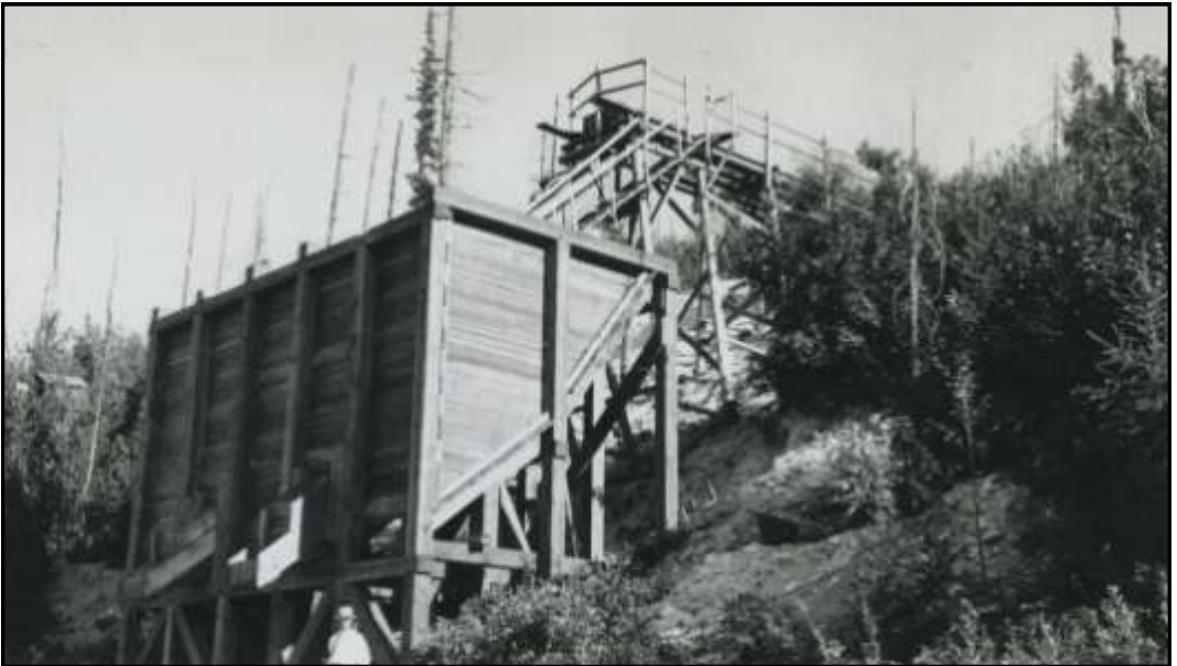
Figure 6: Ore bunker on Blue Grouse Mountain. Other pictures in the Kemp collection indicate that the mill is at the end of the walkway and at the head of the ore chute into the bunker.